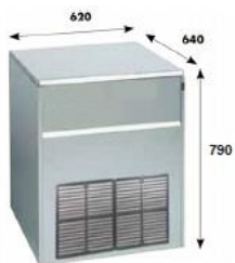
Stainless steel AISI 304